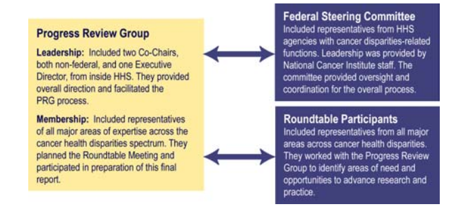
Figure B-2. Organizational Structure for Phase I of the PRG Process

Figure B-2 shows the roles and responsibilities of the different groups of experts who participated in Phase I activities. Listings of the individual PRG Members, FSC Members, and Roundtable participants can be found at the end of this Appendix.